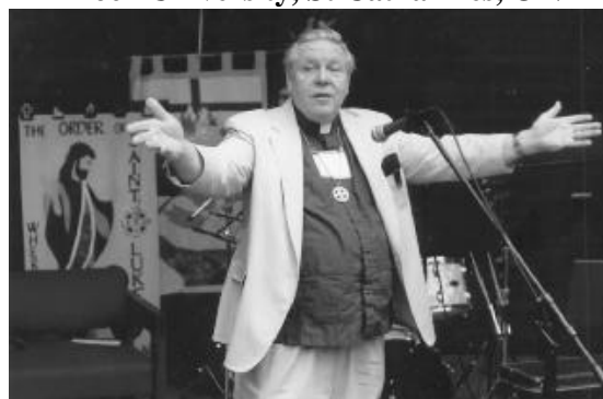
Bishop Alex McCullough North American Warden Emeritus Details and a brochure will follow