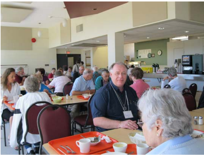
Lunch and Conversation