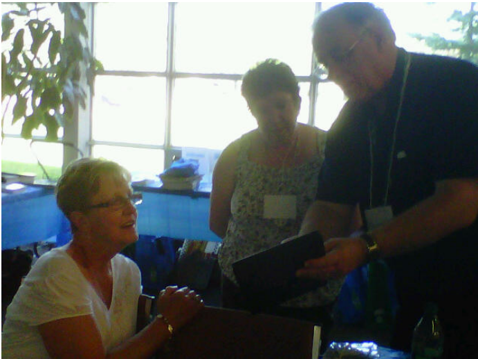
A great opportunity to share with others!

Would you consider making a financial donation to help advance the work of OSL in Ontario? An income tax deductible receipt will be issued in January for contributions over ten dollars, received in 2011.